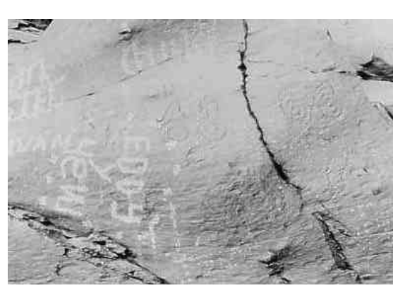
Vandalism of petroglyphs, Rio Chacuey, Dajabon.