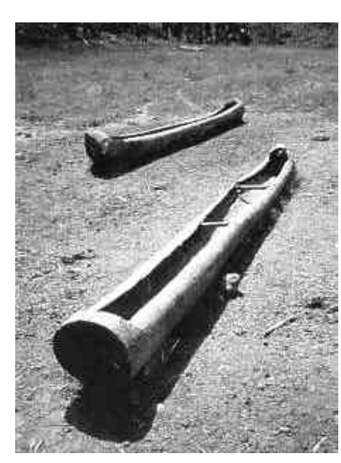
Canoa feed and water troughs in Los Pinos, Moncion

Calabashes, called higuero , made of various sizes and shapes, are still used by rural Dominicans as water receptacles, bowls, and food containers (Figure 7). Macutos , handbags of guano or cana