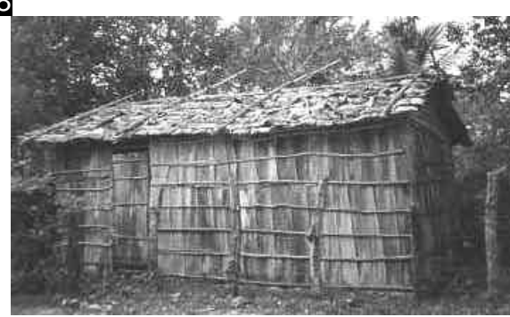
Yagua house in Jamao, Moca