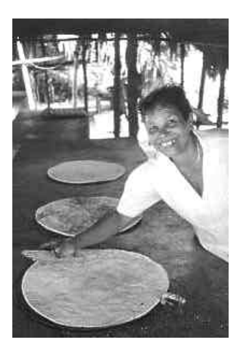
Making casabe at a bakery at Cacique, Moncion

Alternative uses of yucca flour have declined in their importance over the years, however several food products are still made. Panesico are baked logs of yucca flour and pork fat, and are considered a specialty of the Cibao region. Dominican empanadas, deepfried dough pockets stuffed with meat, are only made with yucca flour. Bolas de yuca are deep-fried balls of yucca flour. Jojadra are powdery ginger cookies made of yucca starch.