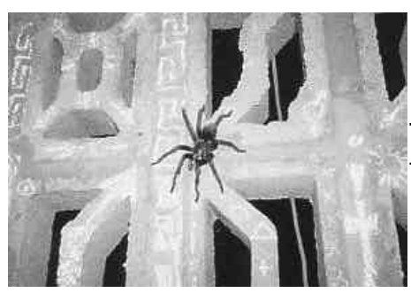
Tarantula, also known by the Taíno word cacata

Some indigenous words have changed their meanings over the years. For example, a batey, which originally described a Taíno ceremonial ball court, today refers to the residence location of Haitians on sugar plantations. Guacara , originally referring to a cave or cavern, now describes a place or thing of antiquity.