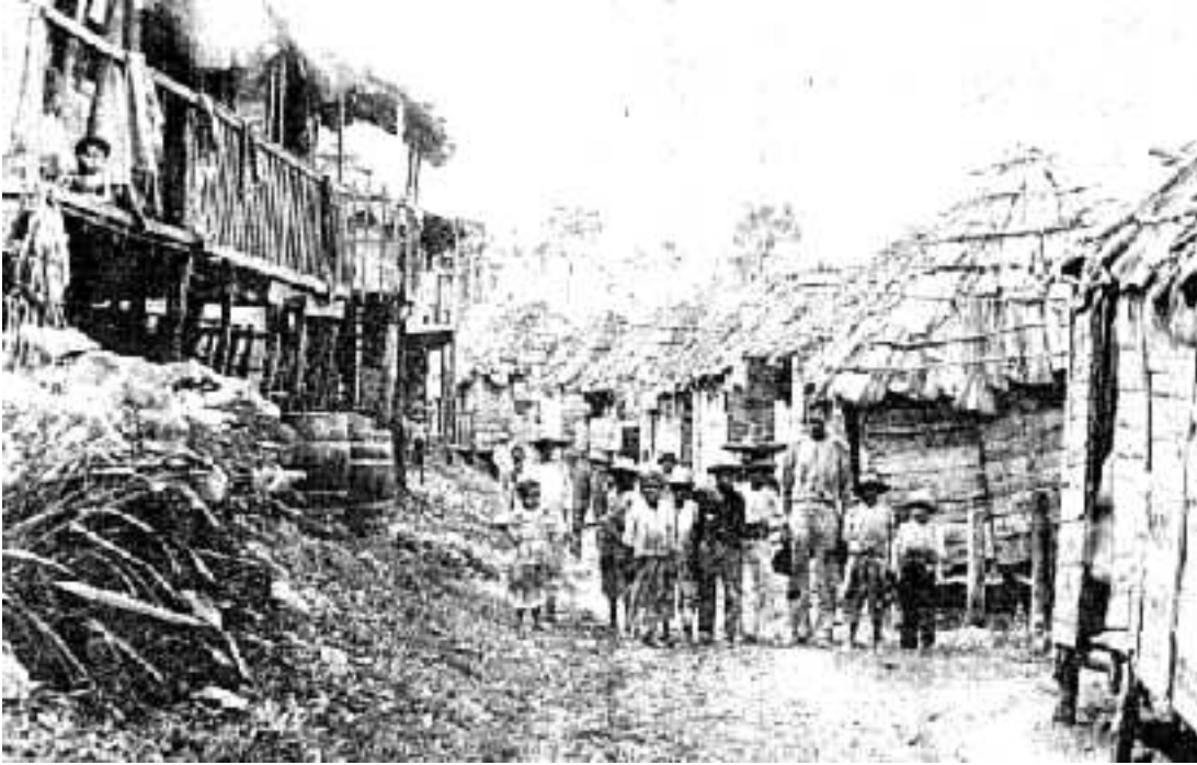
Poor “barrio” in Aguadilla Puerto Rico circa 1899. Poverty was interpreted as inferiority by the U.S. invading forces.